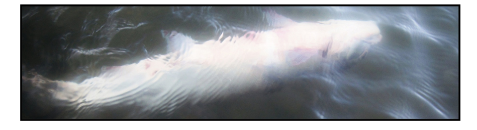
FIGURE 1 An exhausted fish that can no longer maintain equilibrium after a catch-and-release angling event. The exhaustion experienced by this fish could result in post-exercise mortality (PEM), though specific mechanisms behind this phenomenon remain unclear.

are released. The number of individual fish captured and released (or that escape capture) from commercial fisheries is difficult to estimate (Alverson et al., 1994), but presumably exceeds the number of recreationally angled fish by severalfold. These are but a few examples of the relevance of PEM given the sheer numbers of fish that interact with humans and human infrastructure on an annual basis (tens of billions of fish, if not hundreds of billions): all of which have the potential to be subjects of PEM. Clearly, there is a need to better understand this phenomenon in an attempt to predict mortality relevant to different contexts and to consider mitigative strategies to reduce PEM.