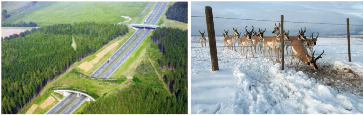
FIGURE 3 Wildlife passage. The GYE has seen a growing number of conservation projects intended to increase landscape permeability for migratory wildlife. Exemplar wildlife passage projects benefiting populations that range into the parks and wilderness areas include: (a) a wildlife overpass and accompanying fencing proposed by the Idaho Department of Transportation to reduce motorist collisions with migratory elk and moose in Island Park, Idaho; (b) ~11 miles of wildlife-friendly fence modification on a private ranch near Cody, Wyoming supported by a USDA-NRCS Regional Conservation Partnership project and benefiting migratory elk and pronghorn populations