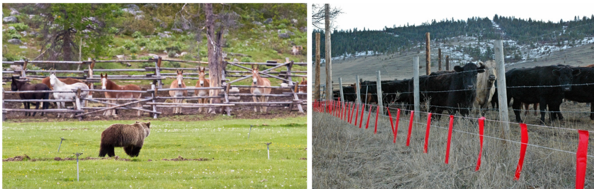
FIGURE 4 Human-wildlife conflict management. A growing number of conservation projects in the GYE also seek to reduce potential conflict between wildlife and people, particularly by mitigating livestock losses to large carnivores and crop damage by ungulates. Exemplars include: (a) An effort by the Centennial Valley Association to reduce conflict with large carnivores across ~385,000 acres by deploying full-time range riders to increase human presence around livestock, monitoring large carnivore presence and activity levels via a camera-trap network, and reducing attractants that can draw carnivores near livestock by removing livestock carcasses; (b) the “Bear Wise” community education and conflict reduction program that the Wyoming Game and Fish Department uses to educate members of the public about minimizing the risk of adverse interactions with grizzly bears. This program also includes livestock carcass removal and other efforts to reduce attractants

cottages—was transferred to the State of Wyoming as a wildlife habitat management area. 1 Conservation easements, where a landowner sells or donates rights—typically the right to subdivide and develop the property (Merenlender et al., 2004)—are more common. Over the past two decades, agencies and NGOs have spent ~$282 million on easements within counties that intersect the GYE (Trust for Public Land, 2019). A 2003 study estimated that establishing easements on key private lands in the GYE would cost ~$687 million (Heart of the Rockies Initiative, 2003). On public land, buyout and retirement of public-land mineral and grazing leases are increasingly common. For example, the Trust for Public Land spent