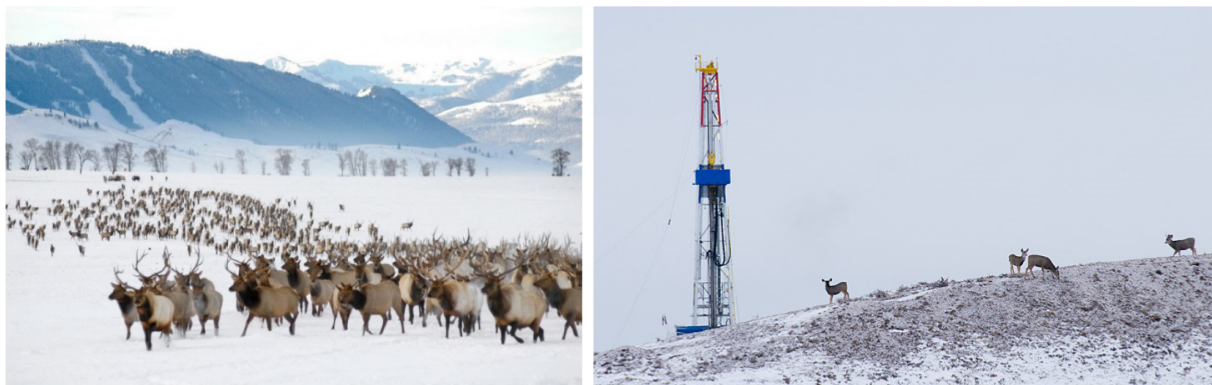
FIGURE 2 Habitat conservation and restoration. Many habitat projects conducted in outlying areas of the GYE benefit wide-ranging wildlife, including populations that spend part of their year in parks and wilderness areas. Exemplars include: (a) the acquisition of 41,156 acres of private land by the state of Wyoming to establish the Spence and Moriarity Wildlife Habitat Management Area; (b) the acquisition of 3,770 acres of private land by the state of Montana to establish Dome Mountain Wildlife Management Area; (c) the acquisition of a conservation easement by The Nature Conservancy of Wyoming on the privately owned Pitchfork Ranch; and (d) the acquisition and retirement of natural-gas leases across ~40,000 acres of the Bridger-Teton National Forest by a coalition of NGOs. Protecting ungulate seasonal ranges and/or migrations routes was a goal of all these projects, but each also benefited many other species including large carnivores, birds, and fish

New wildlife habitat protection in the GYE is often achieved via acquisition, conservation easements, or public-land resource lease retirements (Figure 2). Full-fee acquisition of land is uncommon because of the financial and political issues surrounding public ownership (Merenlender, Huntsinger, Guthey, & Fairfax, 2004), but in one 2015 example, The Conservation Fund paid $1.7 million for a 1.5-km 2 parcel where 5,000 mule deer migrate through a 400 m bottleneck near Pinedale, Wyoming. This land—which had been slated for lakeside