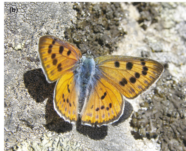
Figure 1. The dark-green fritillary Argynnis aglaja and purple shot copper Lycaena alciphron . The lower elevational limits of these butterflies in central Spain have shifted uphill by 150 m and 400 m, respectively, associated with a 1.3 °C increase in mean annual temperature since 1967–1973 [73]. The loss of such species from lower elevations suggests a failure to adapt to ecological changes at the species' margins.

populations increases the potential for adaptation. Swindell and Bouzat [46] showed that immigration enables a greater response to selection in inbred populations, but here gene flow was among highly inbred populations from the same environment. Similar experiments involving outbred populations evolving under different conditions would help determine under what circumstances migration helps or hinders adaptation at range margins.