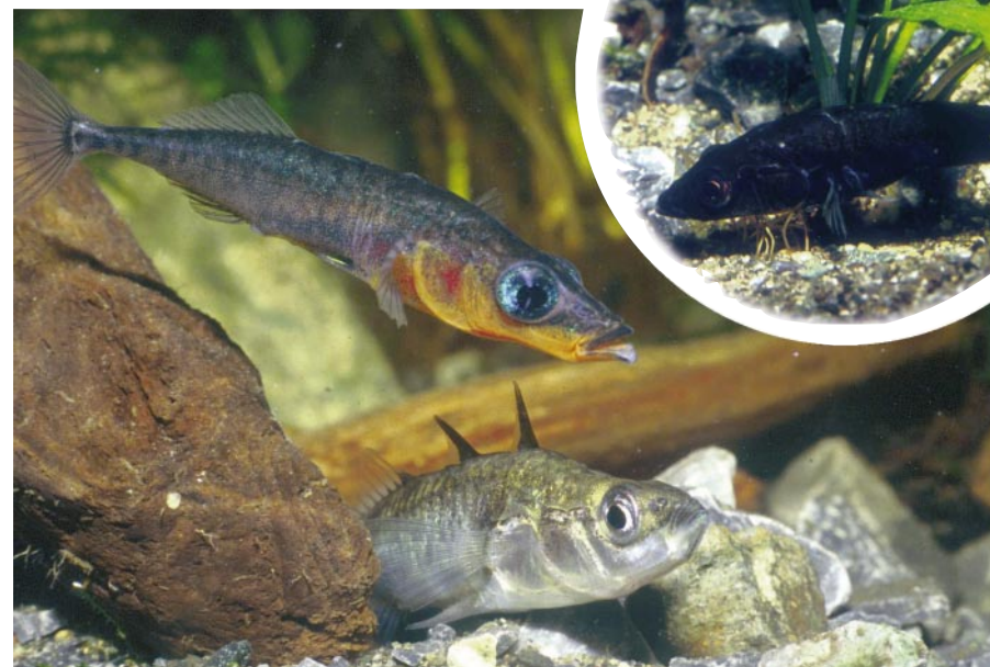
Figure 1 Courting couple — a male stickleback in red mating livery makes a pass at a female. Inset: a male with black mating coloration.

To measure the sensitivity of female sticklebacks to wavelength, Boughman used experiments in which the intensity of monochromatic light is varied to determine the threshold at which a fish ceases to follow rotating black and white stripes. She found that females in areas with less red light, such as where the water is ‘tea-stained’ in colour rather than clear, are more sensitive to red light, and that male signals are matched to female sensitivity. So there is