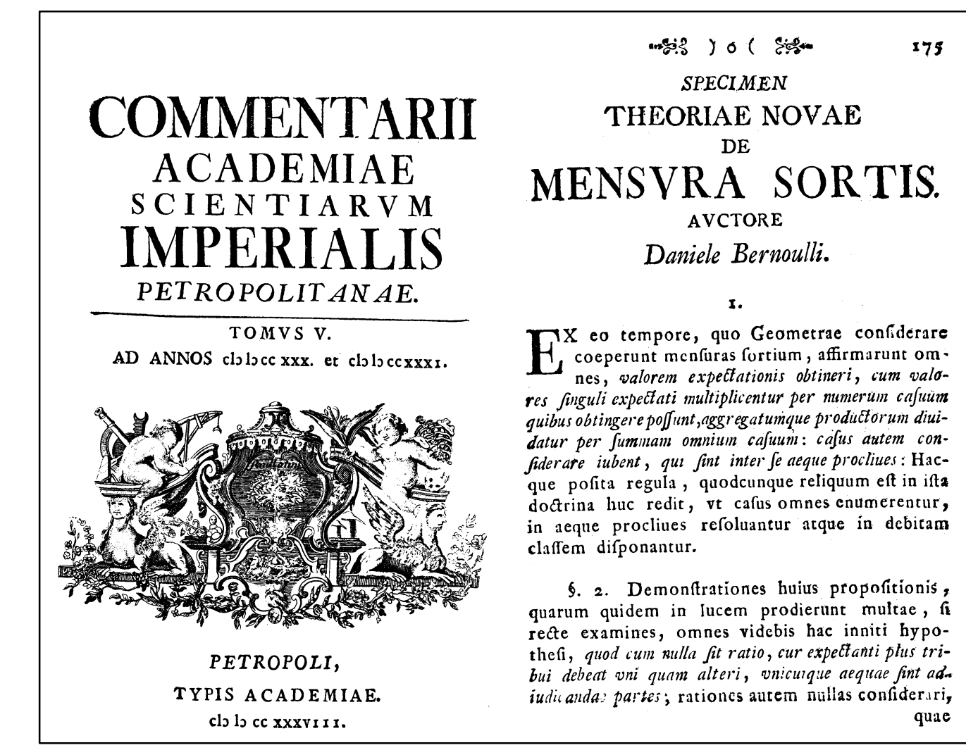
Figure 2. The title page of Bernoulli's seminal contribution, published in St. Petersburg in 1738, to the theory of risk. Those who prefer English to Latin are referred to the 1954 translation in Econometrica (see literature cited).

showed that a strategy that maximizes the geometric mean of returns has the highest probability of reaching, or exceeding, any given level of wealth in the shortest possible time, and it has the highest probability of exceeding any given level of wealth over any given period of time. Gillespie (1974, p 605) noted that "the advantage which a genotype gains through producing many offspring in a good year does not balance the disadvantage from producing few offspring in a bad year." Bulmer (1985, p 70) states, "The type with the higher geometric mean fitness will almost certainly predominate in the distant future." Geometric mean fitness implies that the probability of extinction increases with the variance in pergeneration fitness (Lewontin and Cohen 1969). Those are all good reasons to use the geometric mean to measure fitness.