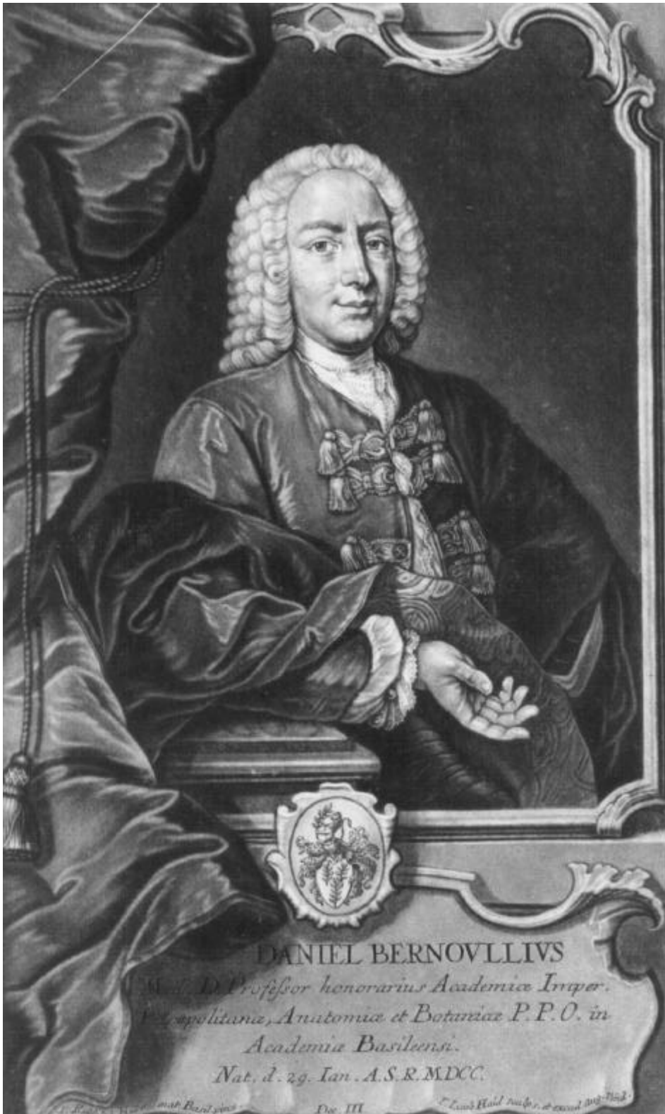
Figure 1. The portrait of Daniel Bernoulli aged 44 honouring his status as Professor of Anatomy and Botany in the medical faculty at Basel.