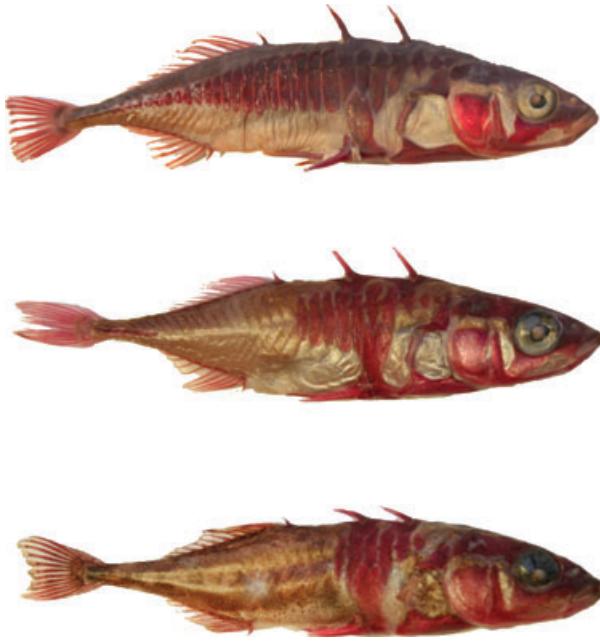
Fig. 1 Le Rouzic et al. (2011) quantified the strength of selection when populations of threespine stickleback evolve rapidly from completely-platedness (top) towards low-platedness (bottom).