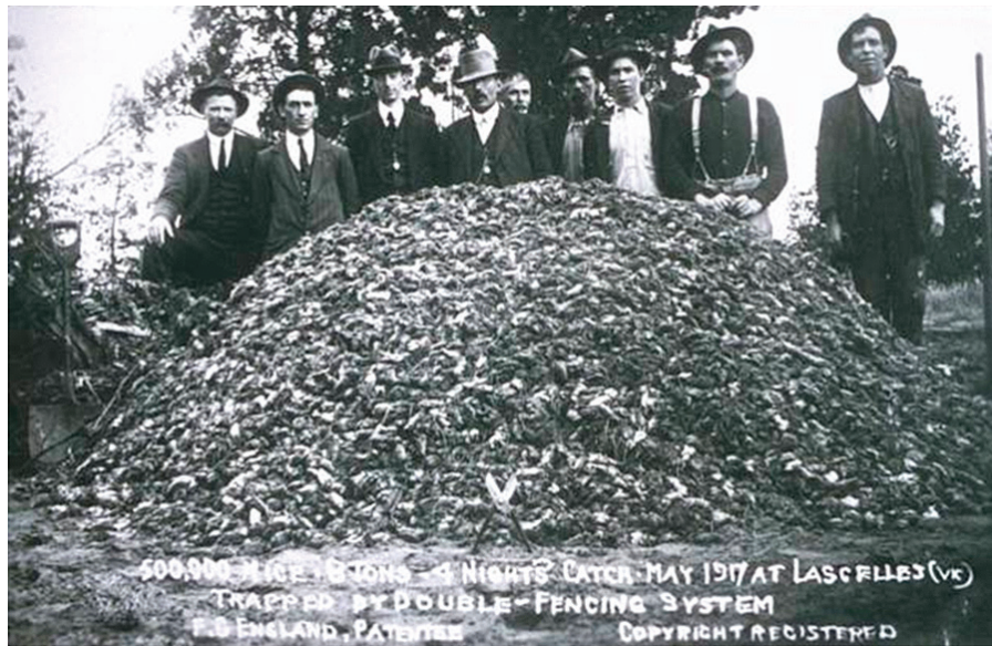
Fig. 3. Some 500,000 mice were captured around stores of wheat in just 4 nights during a mouse plague in northwestern Victoria, Australia, in 1917.

A range of registered and unregistered rodenticides have been used to try to control damage caused by mice to crops. Since the late 1990s, zinc phosphide has been registered in Australia as an in-crop rodenticide. It is commercially produced and the rodenticide is coated on the outside of sterilized wheat grains. It can be spread into growing wheat crops using a calibrated standard fertilizer spreader or applied aerially by light planes. Prior to zinc phosphide being registered, strychnine had temporary registration for use during mouse plagues. It was used heavily during the 1993-94 mouse plague in South Australia and Victoria, where 350,000 ha were baited. There was evidence that the strychnine could be taken up into the plant under certain soil conditions and this led to it being banned for broad-scale use in the field. Zinc phosphide and strychnine are “acute” rodenticides that act relatively quickly.