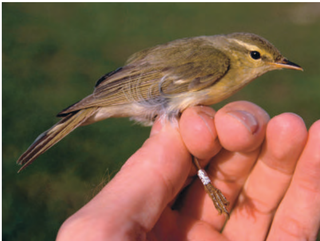
Figure 1. Green Warbler Phylloscopus (trochiloides) nitidus , Ottenby, Öland May 29, 2003. Kaukasisk lundsångare P. (t.) nitidus, Ottenby, Öland 29:e maj 2003.

nitidus or rather an unusual example of P. t. viridanus , it was decided to send the blood sample for DNA analysis.