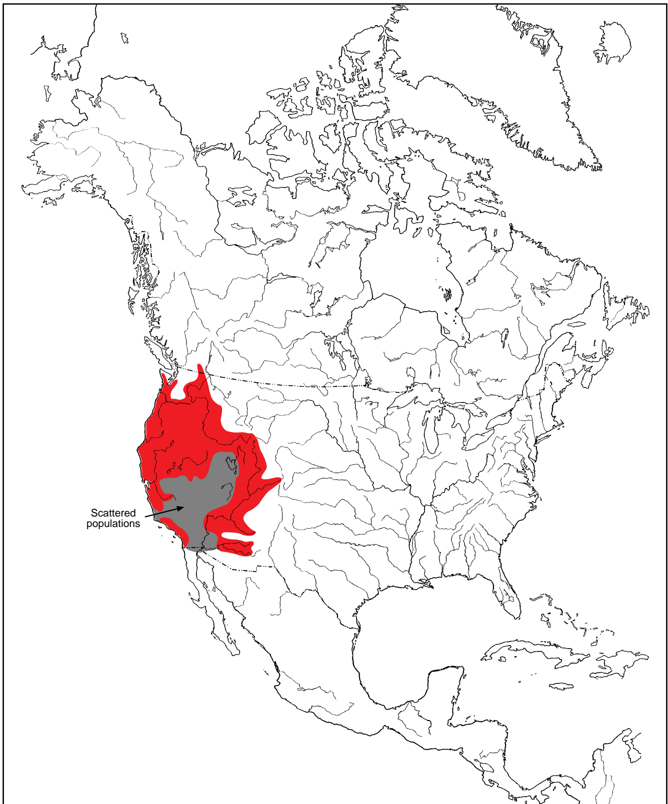
Figure 3 - outline of the distribution of the speckled dace, Rhinichthys osculus .

The only published sources of life-history information on the B.C. population of speckled dace are those of Peden and Hughes (1981, 1984) and Peden (1994). What follows is a summary of their biology derived from these and other sources, supplemented in a few places with personal observations.