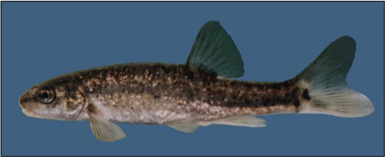
Figure 1 - Speckled dace, Rhinichthys osculus .