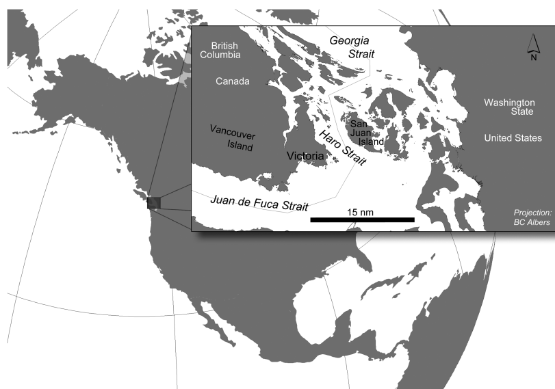
Figure 1 Map of the study area, with place names referred to in the text.