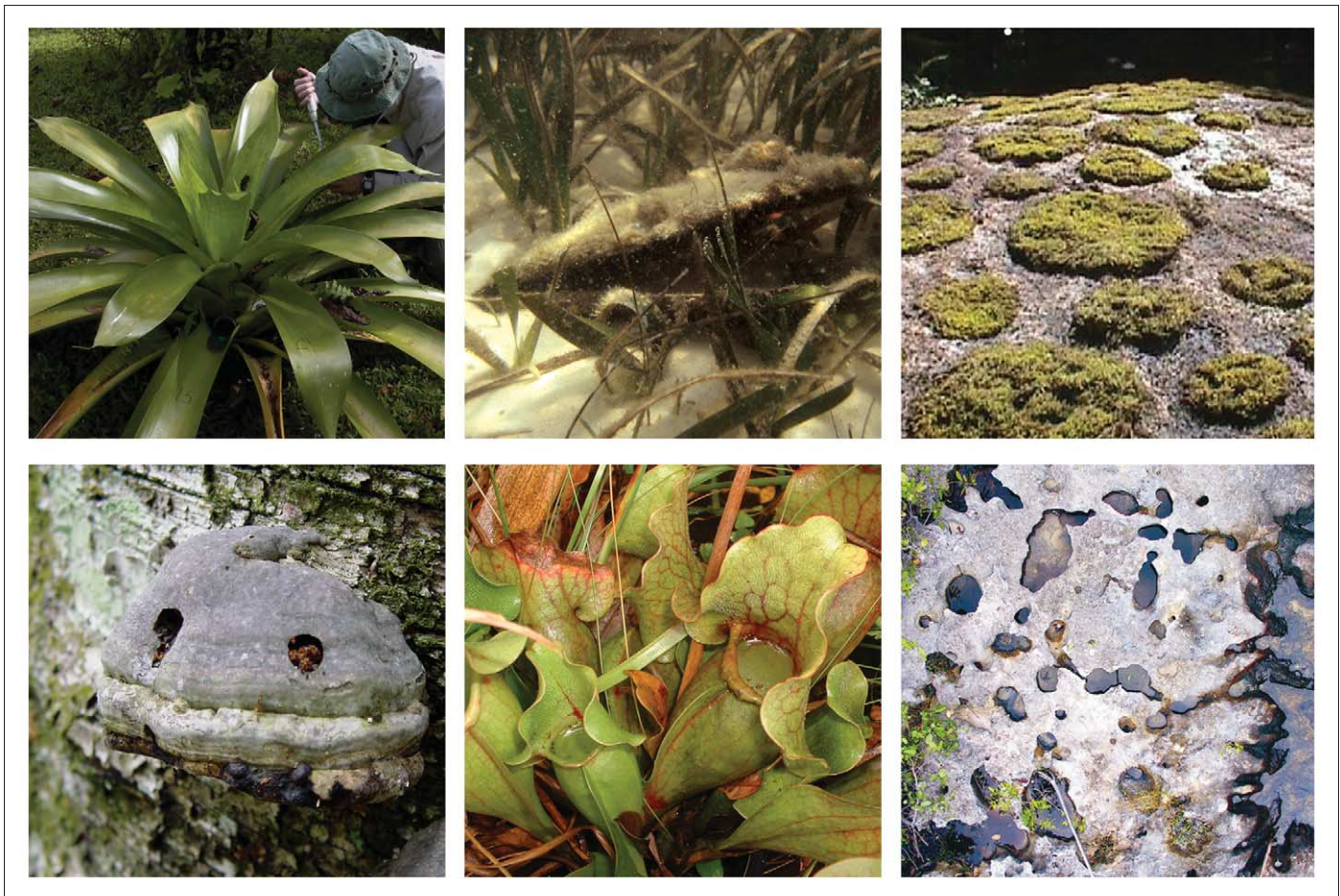
Figure 1. Examples of natural microcosms. (a) aquatic insects in bromeliads (b) marine invertebrates colonizing pen shells (c) micro-arthropods in moss patches (d) beetles in fungal sporocarps (e) aquatic food webs in pitcher plants and (f) invertebrates and micro-crustaceans in rockpools.

involved assembling random subsets of monotrophic communities, such as grassland plants in 1-m 2 plots. Such manipulations of synthetic communities have been useful for the development of theory, but the current challenge is to extend these results to multitrophic food webs of coevolved species experiencing real patterns of species loss [15,16]. Natural microcosms have the potential to play a particularly important role at this stage of the diversity–function research program, because real local extinctions can be easily (and ethically) induced by changes in the habitat, and because responses can be tracked over multiple generations and through multiple trophic levels.